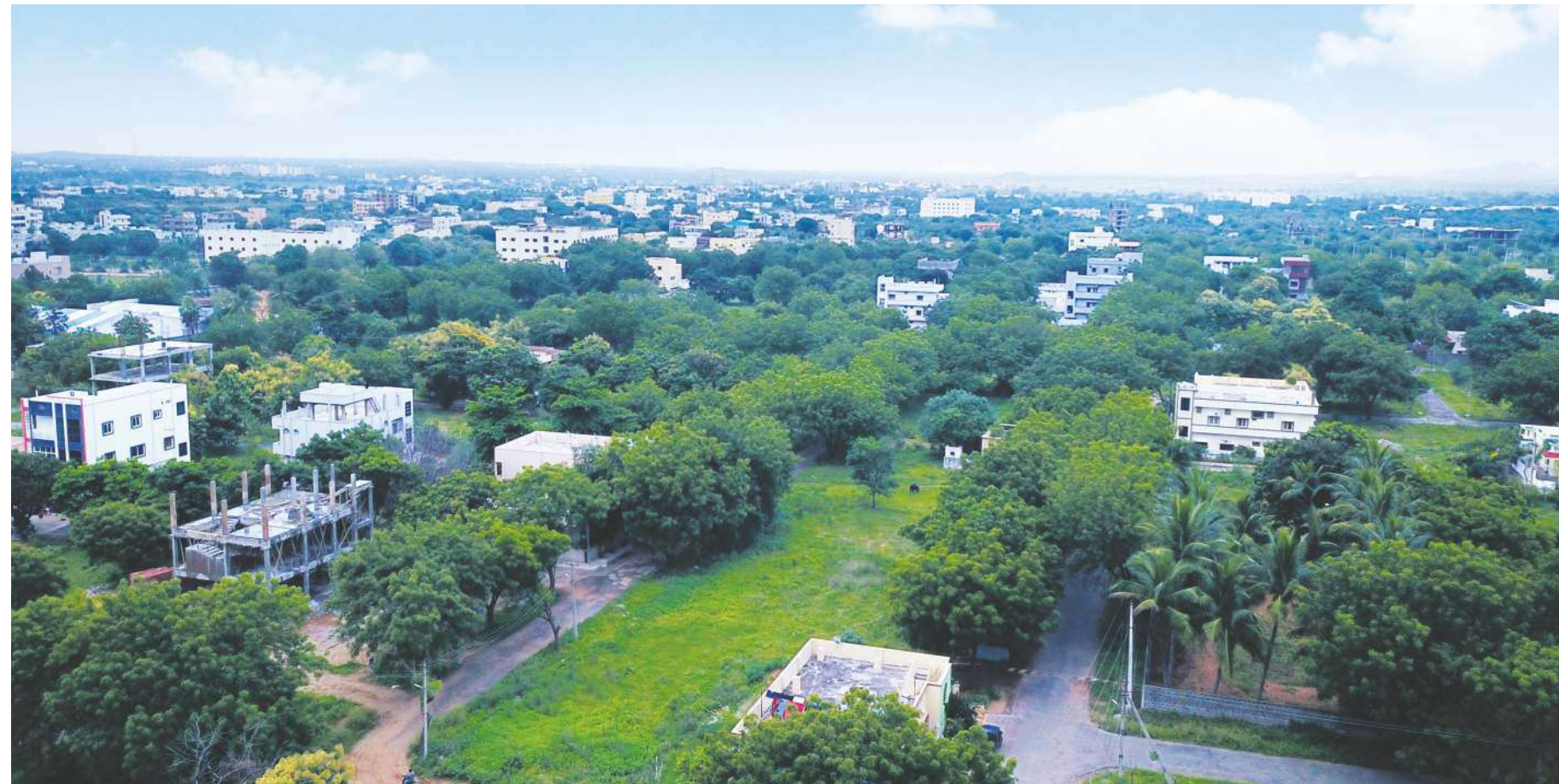
Suprabhat Township Venture - I ▲