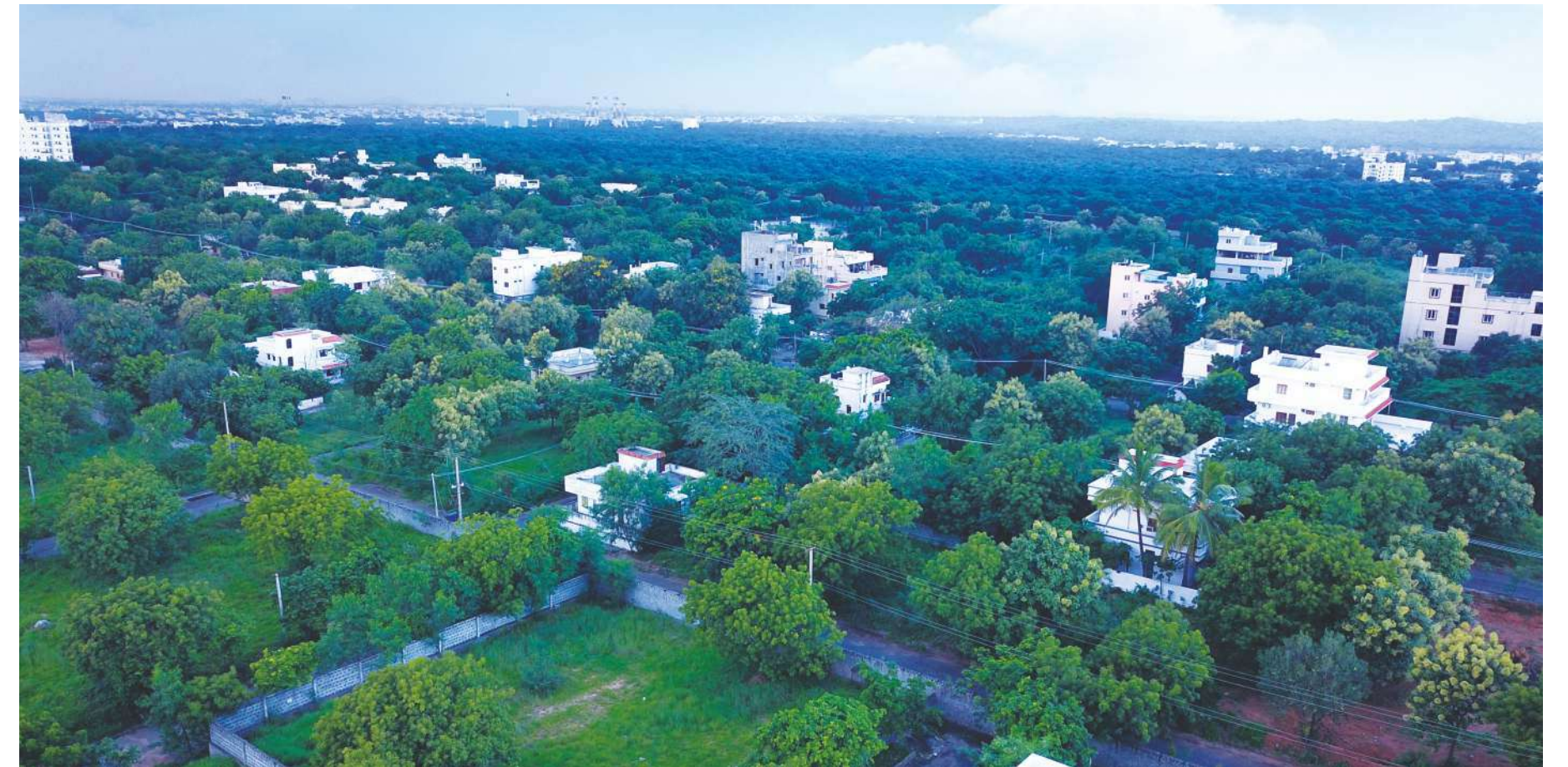
Suprabhat Township Venture - III ▲